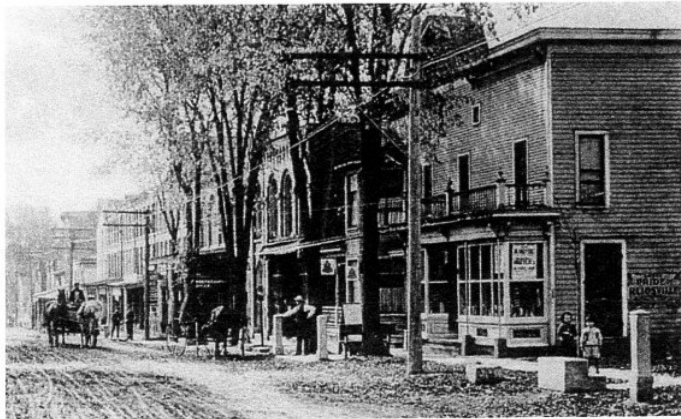
The Frontenac Historical Society and Museum presents: